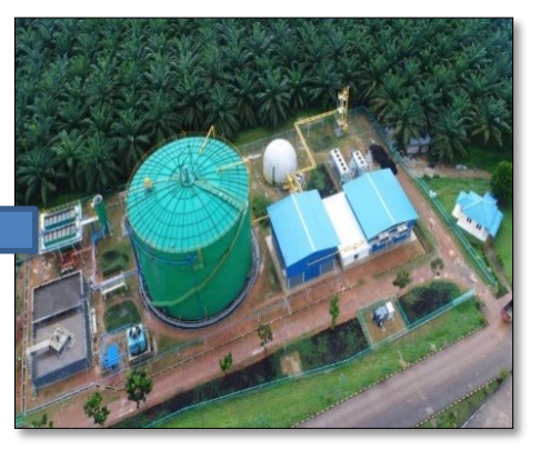
DECARBONISE SUPPLY CHAIN (PALM OIL) BY CAPTURING BLOMETHANE