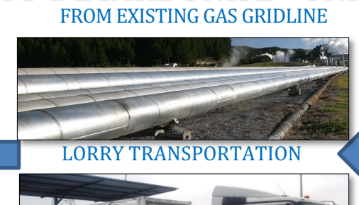
DECARBONISE LOGISTICS BY REPLACING FOSSIL FUEL WITH BIOMETHANE