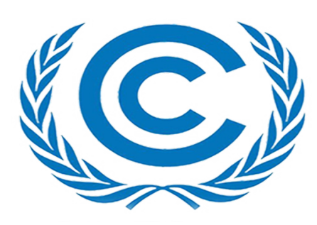
UNFCCC Approved CDM-POA Since 2012