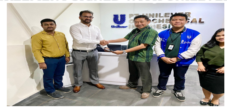
FEED STOCK AGREEMENTS