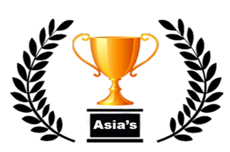
Most awarded brand For Biogas, BioCNG