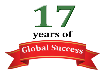
Company with 100% track record & 70% revenue from repeat orders