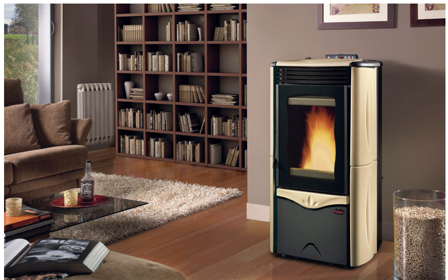
An example of wood pellet stove with high efficiency, clean burning, and easy to use. Photo: Duchessa idro, Narvells